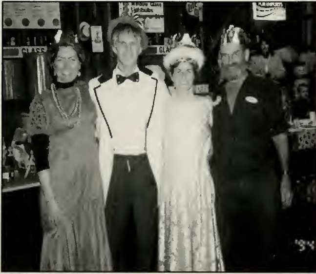
2 nd Annual "Formal" Dance at Da Dump