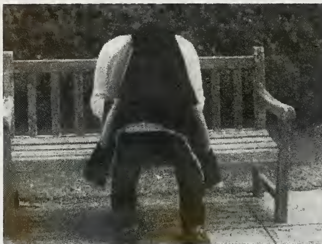
Wi-Fi in the rain after hours at the Hancock Town Library, June 2009

“Libraries are the soul of many communities in America, and I feel the need to fight for them. If we can bail out banks and Wall Street investment firms, we can support our libraries, which are desperately needed, now more than ever...”