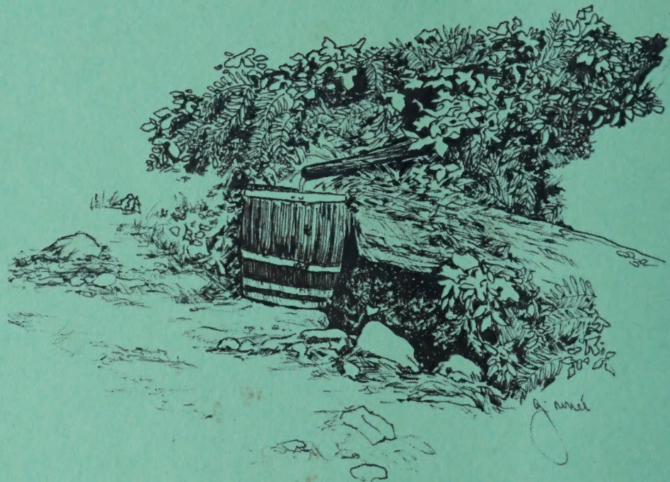
" WATERING TROUGH "