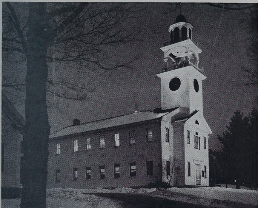
THE BAPTIST CHURCH OF NEW LONDON