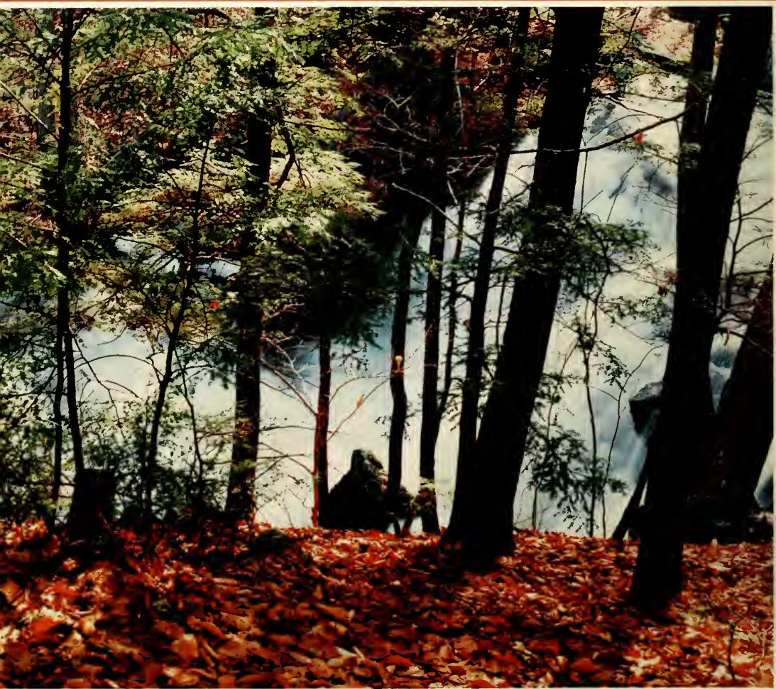
Pevery Falls off Baptist Road