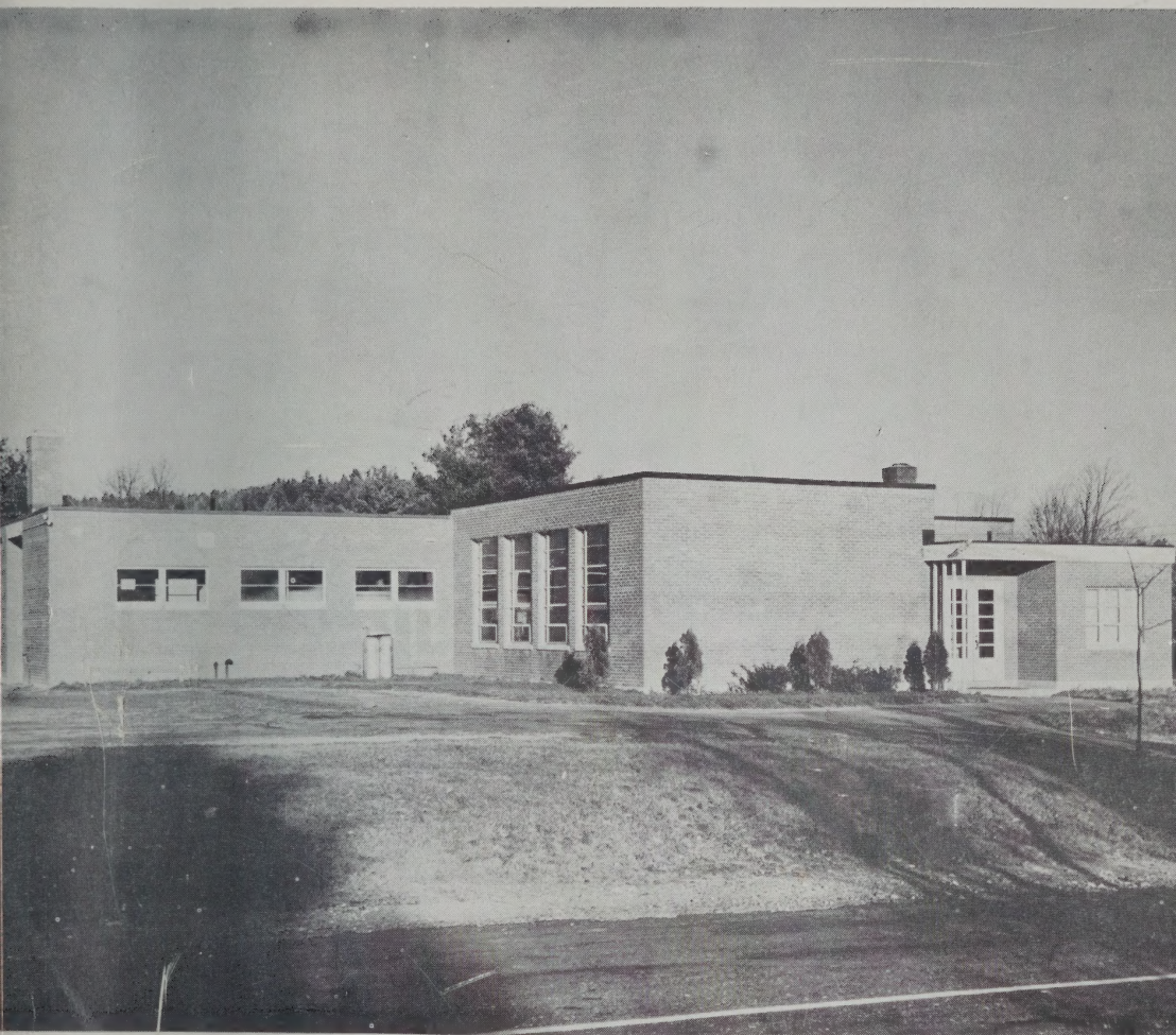
THE LYNDEBOROUGH SCHOOL