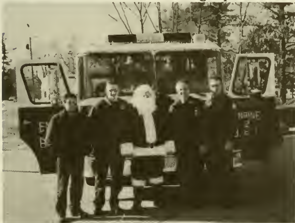
Fire Department transports Santa Claus

During the year, Staff worked on ambitious plans for implementation in 1999 to improve staffing, offer pay incentives for advanced EMT training, and for a capital program to replace aging fire-fighting equipment. Town Council endorsed these initiatives in its 1999 Budget process.