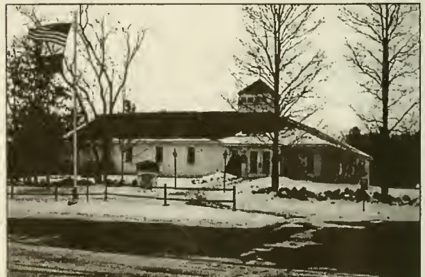
Town Offices - 1998