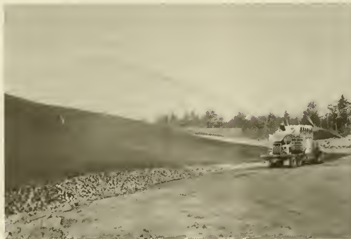
At closure of Landfill: Hydroseeding

Projects completed in 1998 include: Constance Street, Rosehill, Hawthorne Drive, the Murray Group and the continuation of Village Green. In 1999, we plan several laterals in the Route 3 corridor and an update of our sewer plan.