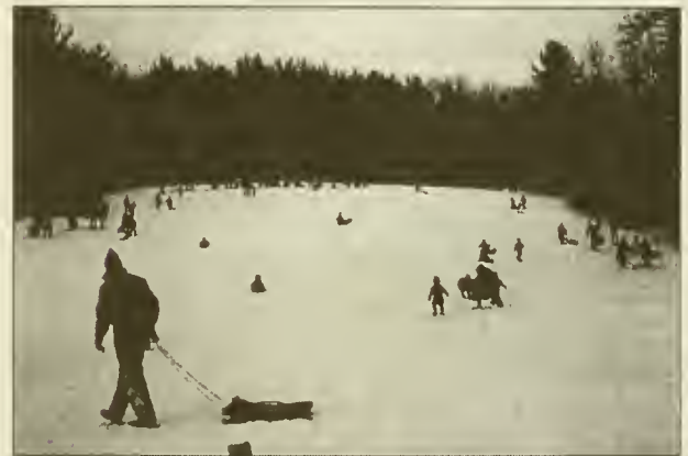
Bedford Sledding Hill

Our programs are very successful because so many individuals and organizations generously contribute time, energy, and funding. In 1999 we will be getting ready for our 250 th anniversary in the year 2000. Please call to volunteer your help in planning special events for our birthday year.