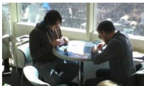
Two of the many students who gathered at the MUB to make for Japan