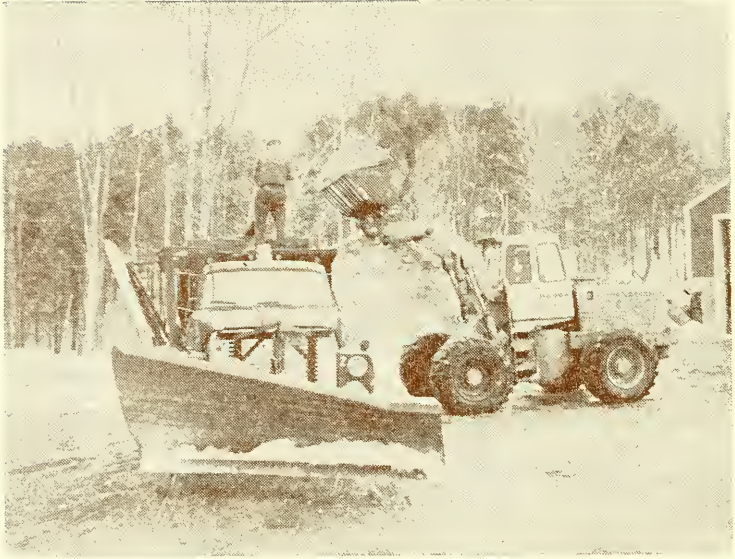
A typical operation this winter, the loading of salt into spreaders for ice removal.