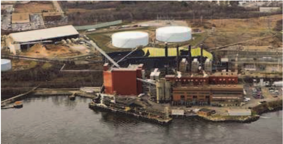
Fig. 5. Schiller Station, Portsmouth, NH.