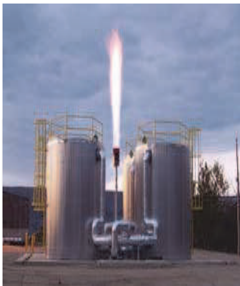
Fig. 2A. Mt. Carberry Landfill, Berlin, NH.