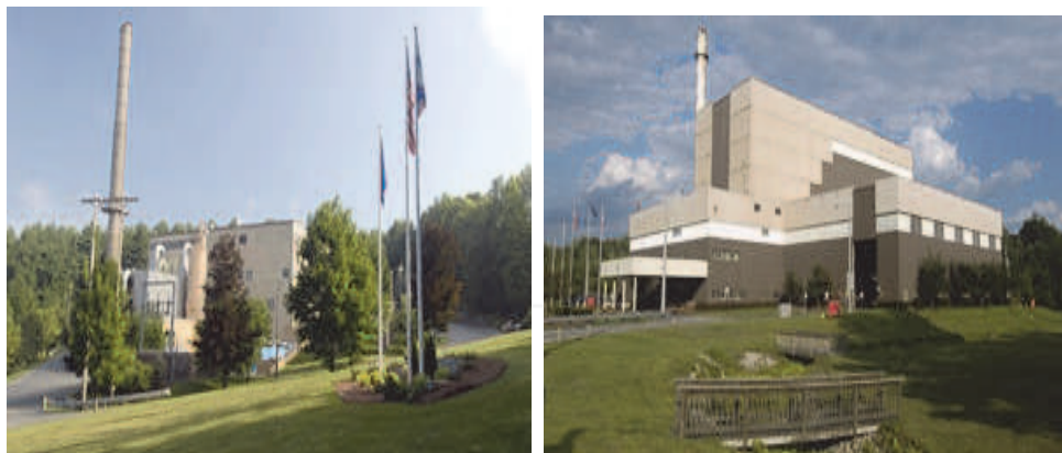
Fig. 7. A and B. Wheelabrator Technologies, Inc. in Claremont and Concord, NH, respectively.