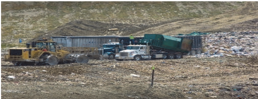
Fig. 1. Turnkey Recycling and Environmental Enterprises, Rochester, New Hampshire.