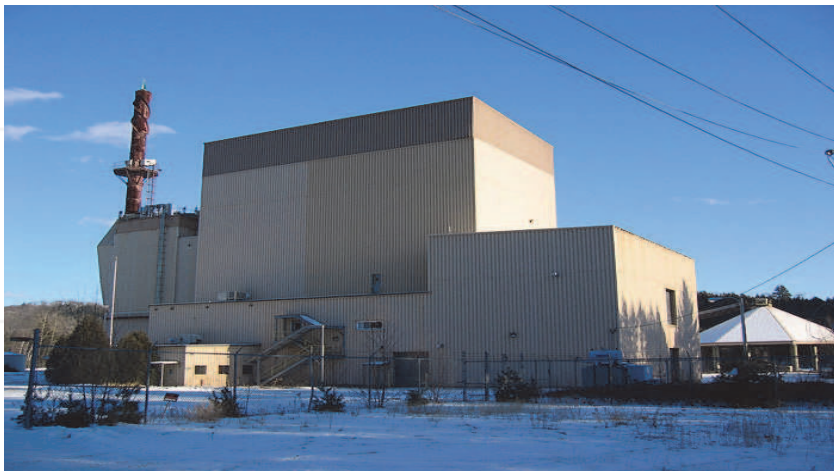
Fig. 4. Indeck Energy Services, Inc., Alexandria, NH.