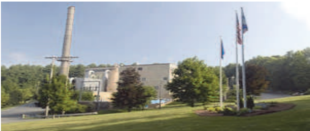
Fig. 6. Wheelabrator Technologies, Inc., Claremont, NH.