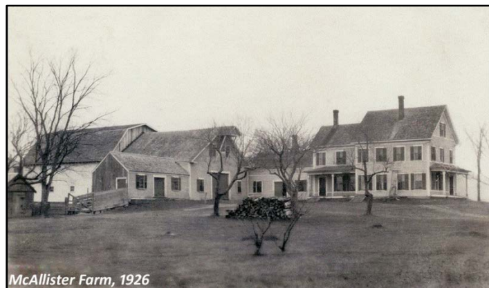
McAllister Farm, 1926