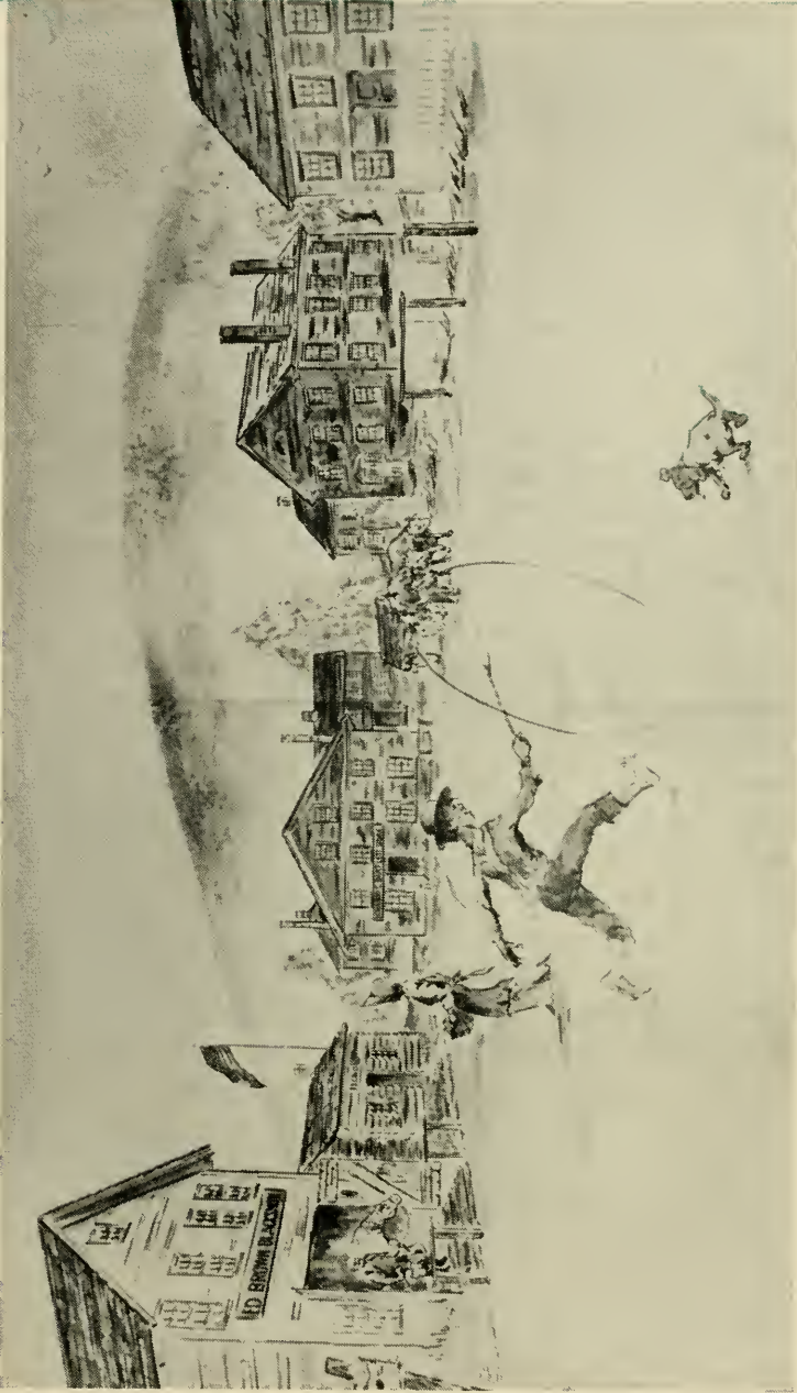
Annual Reports 1969 - Bristol, New Hampshire