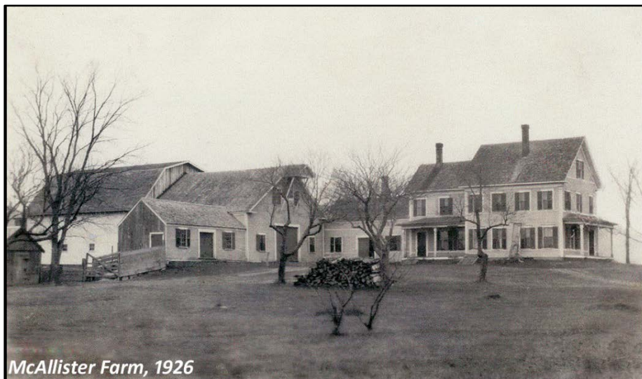
McAllister Farm, 1926