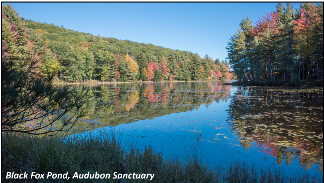
Black Fox Pond, Audubon Sanctuary