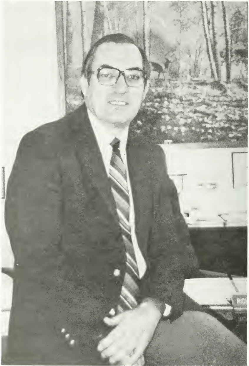
MAYOR RICHARD GREEN