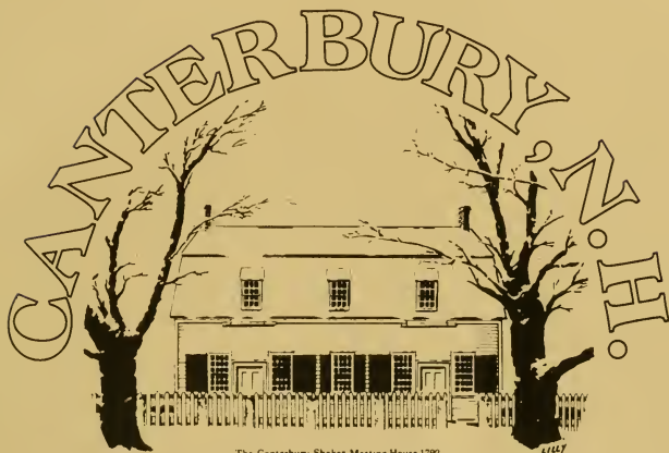
The Canterbury Shaker Meeting House 1792