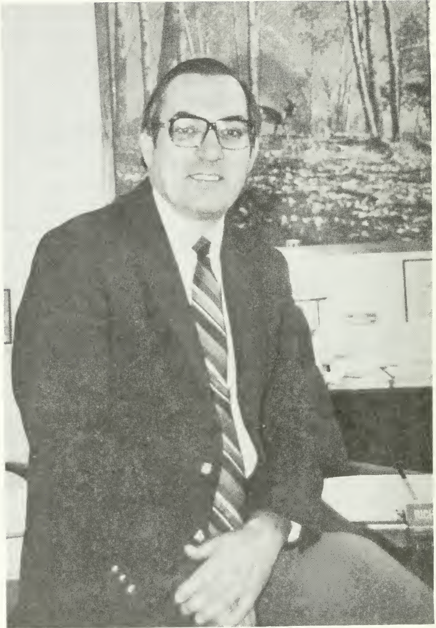
MAYOR RICHARD GREEN