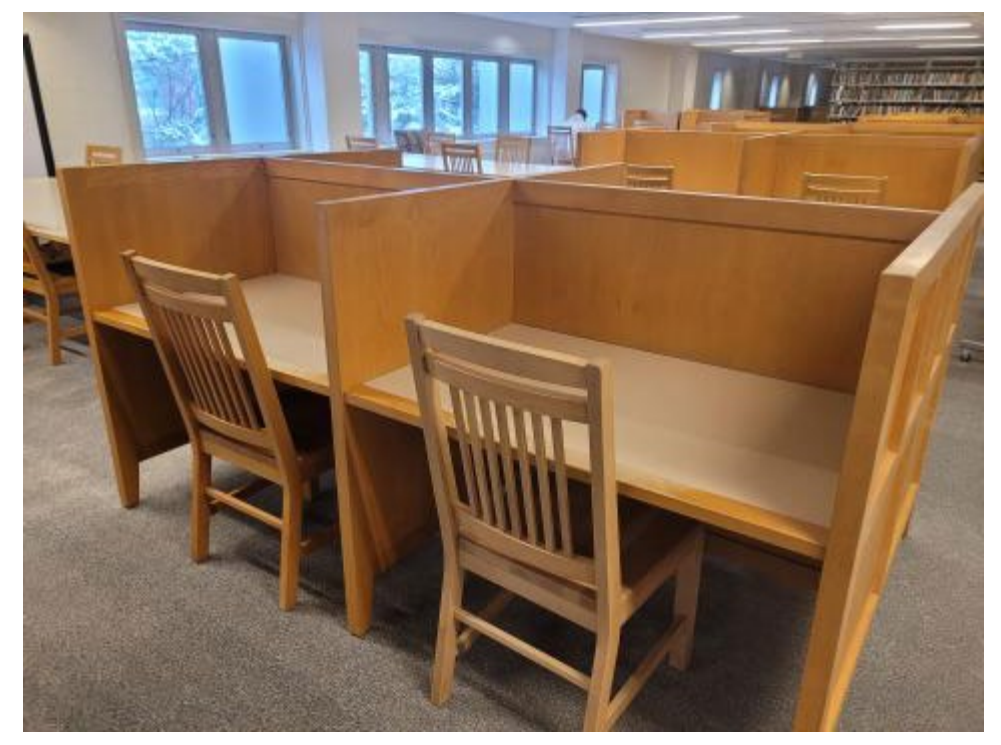
A glimpse of refinished study carrels in Dimond Library.

Work on refurbishing efforts finished in October of 2022, although opportunities for funding can still be continued through other gift funds including the 603 Library Project. Examining the sustainable effects of UNH's restoration progress, it is exciting to see what can be accomplished when individuals collaborate towards a shared purpose.