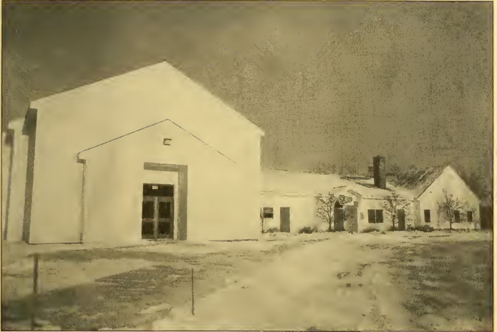
The Stoddard Multipurpose Room James Faulkner Elementary School