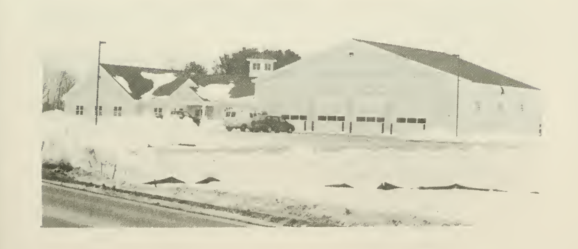
Madbury Safety Complex January 2003