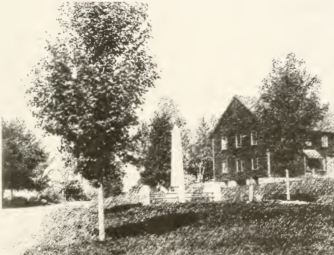
Dow Common @ 1888