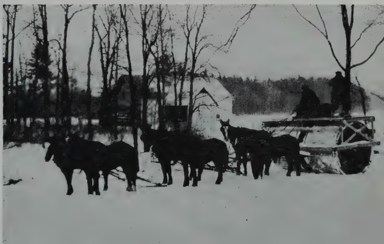
Snow Roller, North Sutton