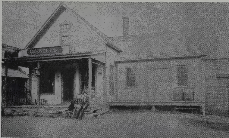
G. G. Wells' Store, South Sutton