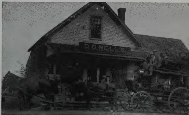
Wells' Store and Stage Coach, South Sutton