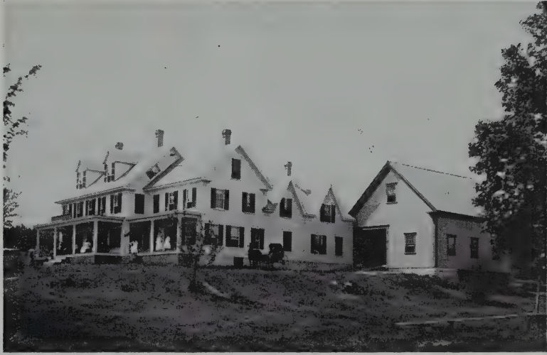
Prospect House at North Sutton