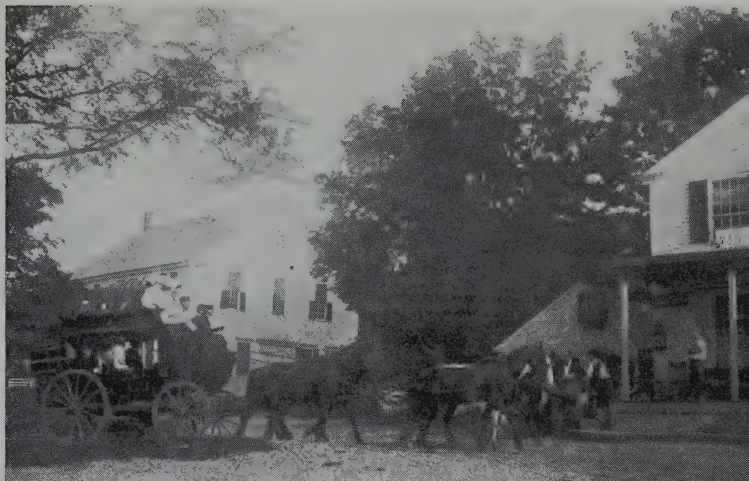
General Store, Church and Stage Coach, North Sutton (c.1900)