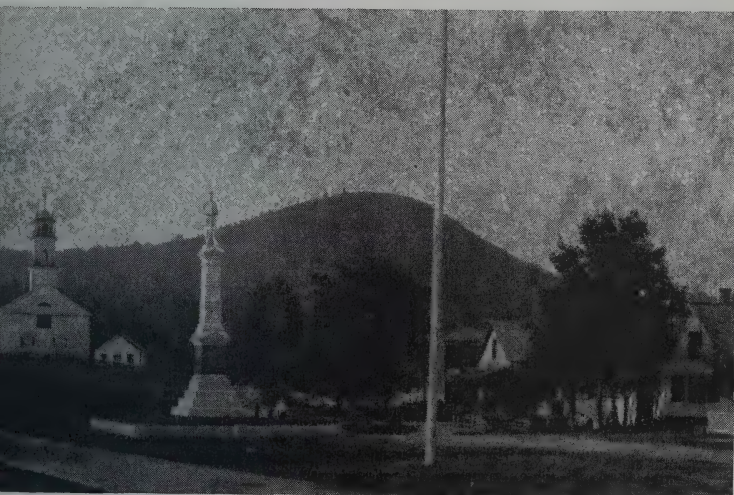
Pillsbury Monument, Church and South Sutton Common (c.1895)