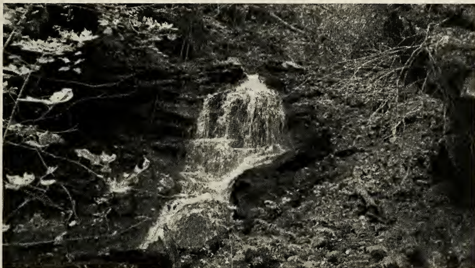
Smith Falls, Enfield NH