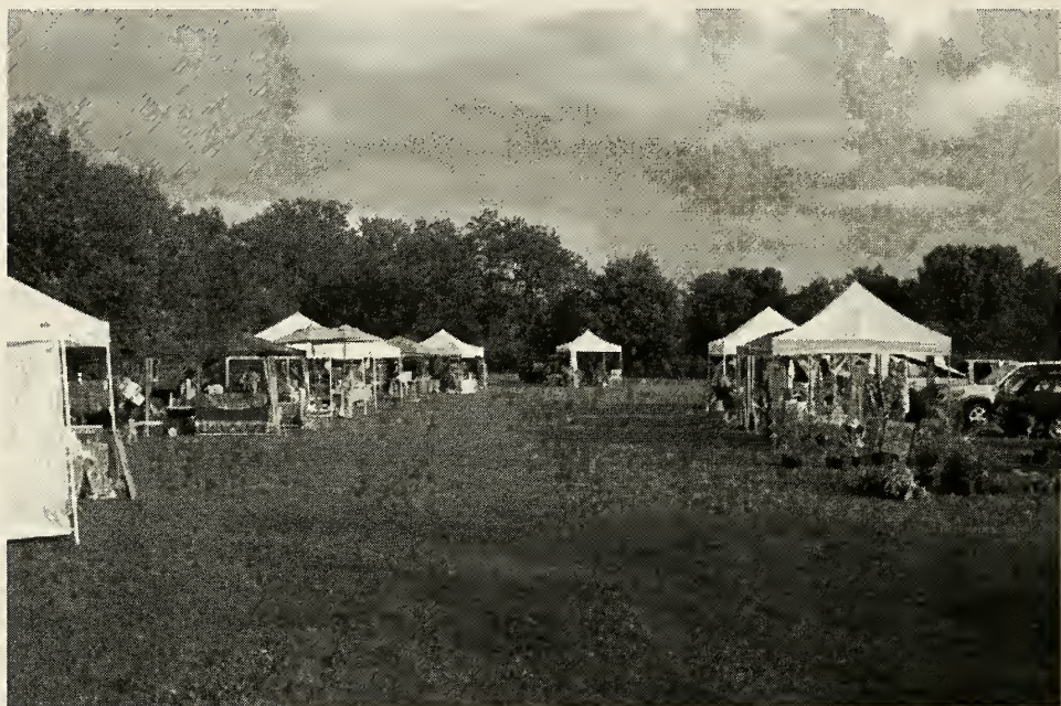
Getting Ready for Market Enfield Farmers Market at Huse Park US Route 4, Enfield

Enfield Village Association is a non-profit community-based organization whose support comes from the community and whose activities all provide direct benefits to everyone living in Enfield, as well as property owners and businesses. While our primary focus is the revitalization of Main Street in the heart of the village, we are committed to enhancing the quality of life of all residents by strengthening our spirit of community, making our downtown more attractive and increasing the opportunities for Enfield businesses to prosper. In short, we are Enfield residents working for Enfield!