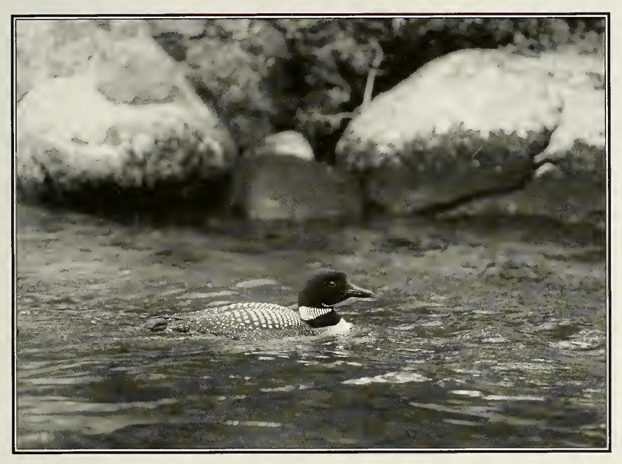
Loon on Squam Lake