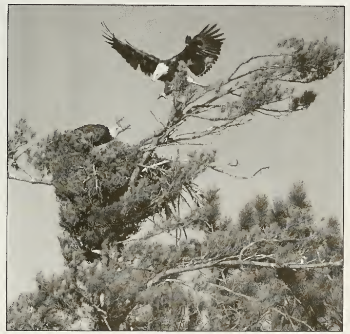
Eagles on Loon Island, Squam Lake