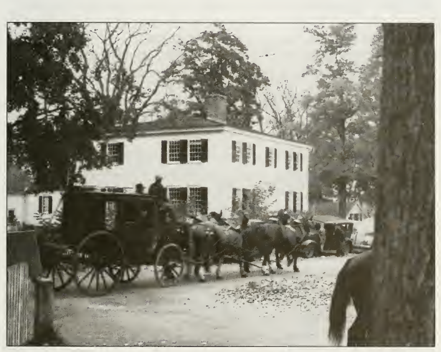
1948 Sandwich Fair Parade

The report was unavailable at print time.