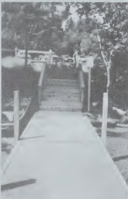
Cattle Landing Municipal Docks