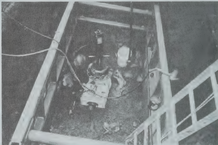
Water Main Valve Installation on Plymouth Street

We would like to thank you for your support and thank the various Departments that have assisted us throughout the year.