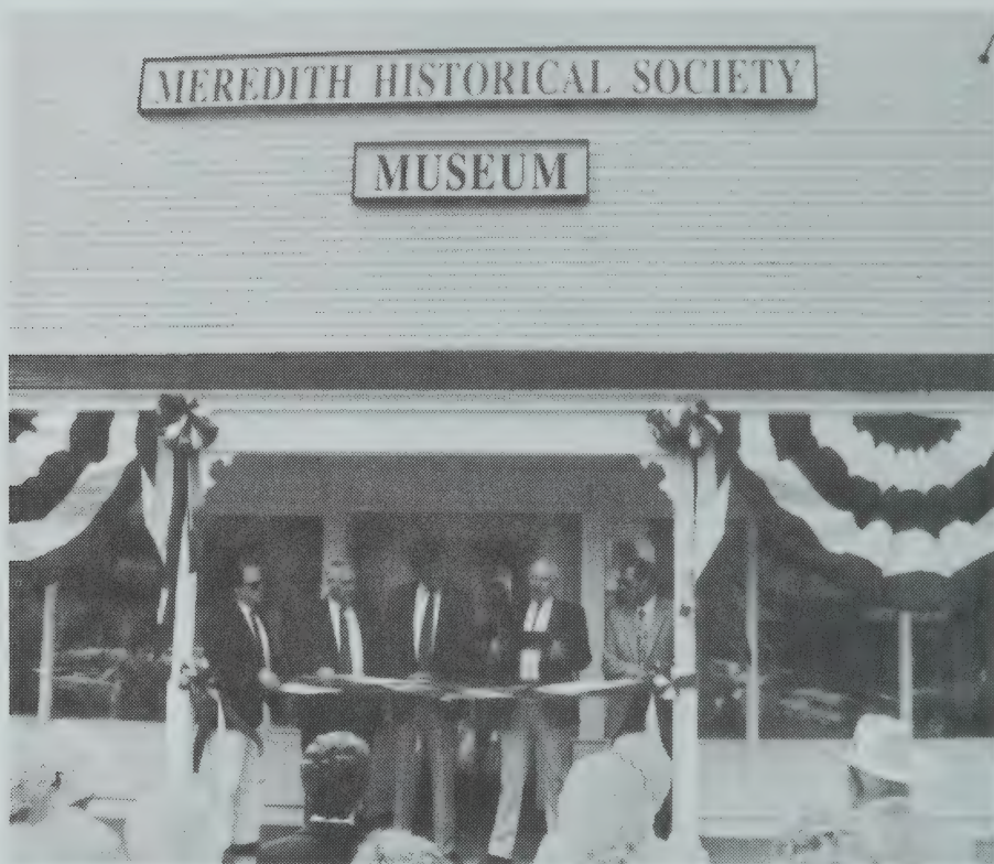
Above: Ribbon-cutting ceremony at the Main Street Ladd Building officially opening Meredith's new historical museum, May 20, 1995.

In May we witnessed the dedication of our new Main Street Historical Museum. This celebration recognized an extraordinary community effort that transformed a vacant store front into a central show piece of local history. Through the determination and commitment of the Meredith Historical Society, the Meredith Rotary Club, the Meredith Village Savings Bank, the Town of Meredith and others, a distant dream soon became a reality. Acquisition of the historic Ladd building and its renaissance as a cultural center will prove to be an invaluable community asset for generations to come.