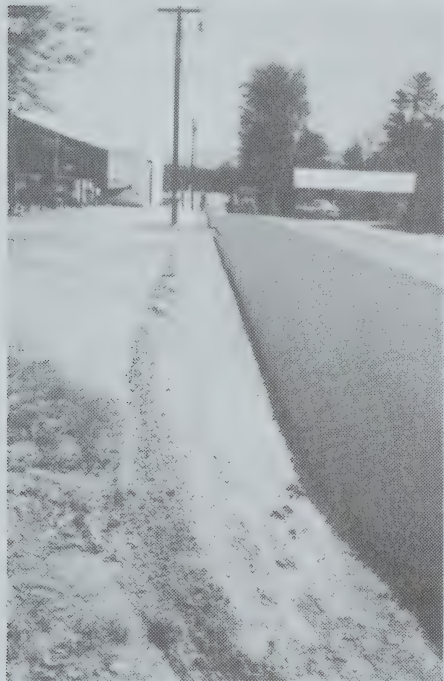
Lovejoy Sands Road Reconstruction

On behalf of all employees at the Public Works Department, I thank you for your continued support and cooperation.