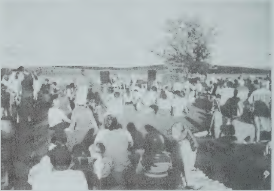
1995 Concert In The Park Series

We want to thank the community for its continually growing support and interest in our programs and projects.