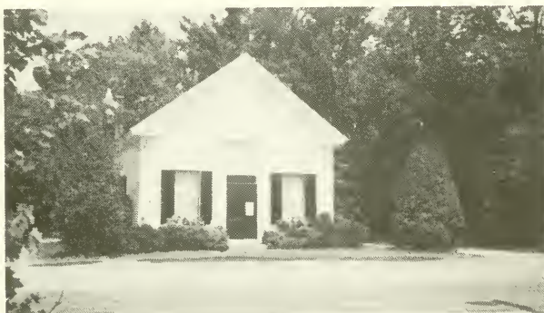
Madbury Town Hall 1968