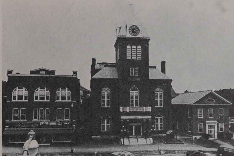
DeWolf Block - Court House - Records Building