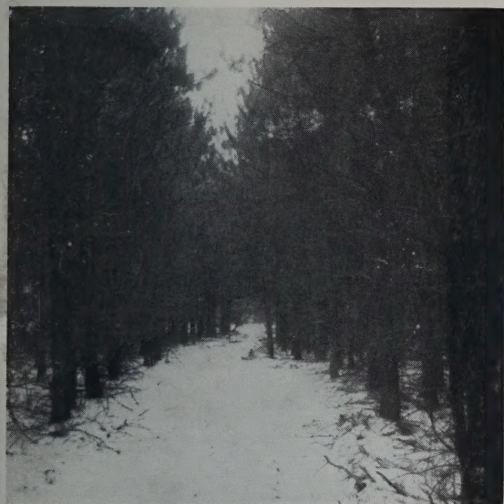
Richmond Town Forest Plantation