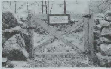
Recently installed gate and sign at the 1809, restored Town Pound, located at Meeting House Park. Entered in National Register of Historical Places 1980.

Many exciting changes have been accomplished at the new town park surrounding the Meeting House on the Old Bay Road. The tumbled down town animal pound, erected in 1809, has been restored rock by rock by Nelson Chamberlain and Walter Mains. The rock enclosure was used to impound animals that had strayed into a neighbor's cornfield or garden patch and their owners had to pay a fine to reclaim them.