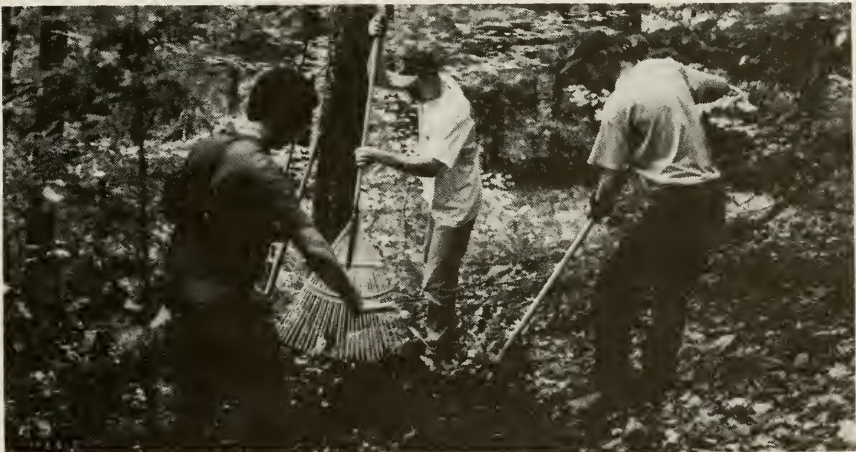
UNH Cycling Team Members and Coach work on a trail section at Hicks Hill.