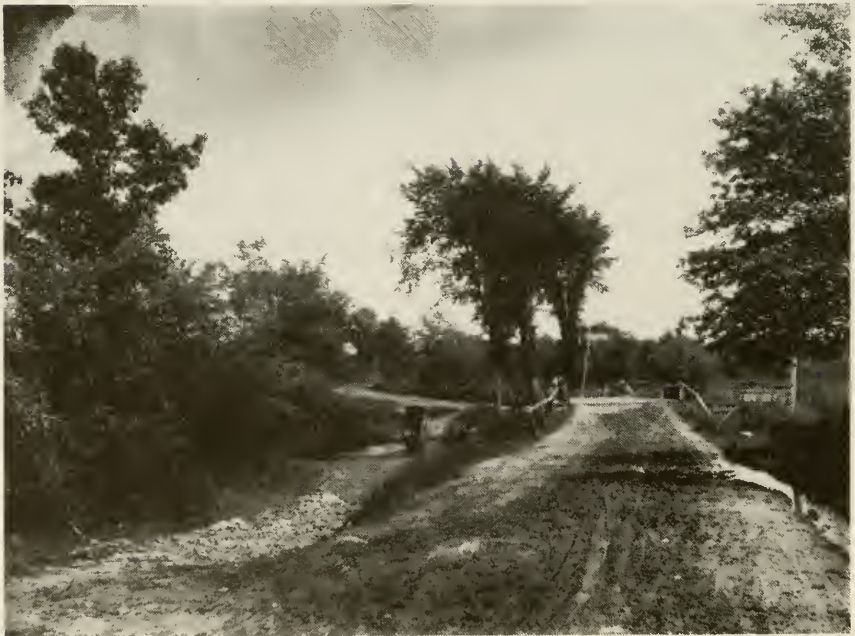
Mallego Brook (Littleworth Road) — July 25, 1906 Wentworth Collection

*denotes payment made in 1996 before printing of Town Report