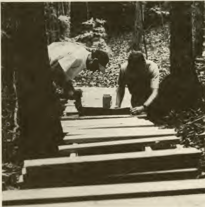
A boardwalk takes shape.