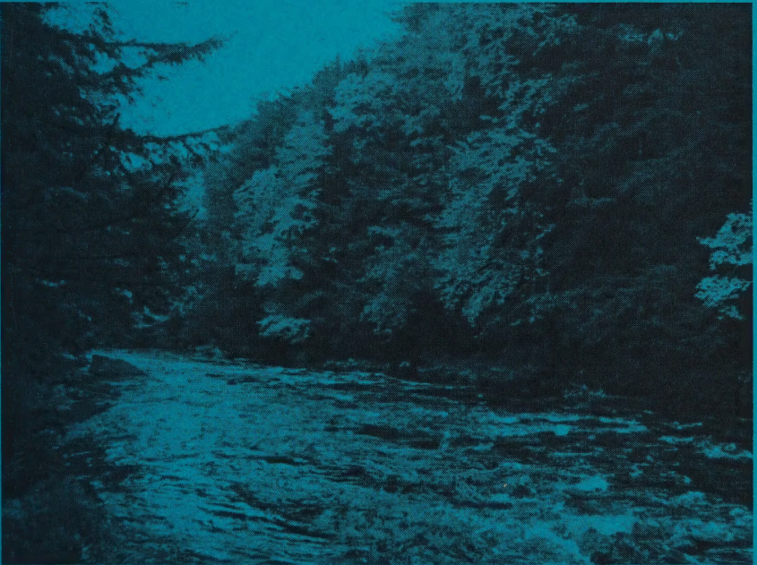
View of Blackwater River