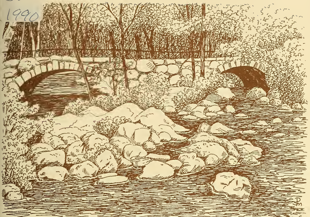
Stone Arched Bridge