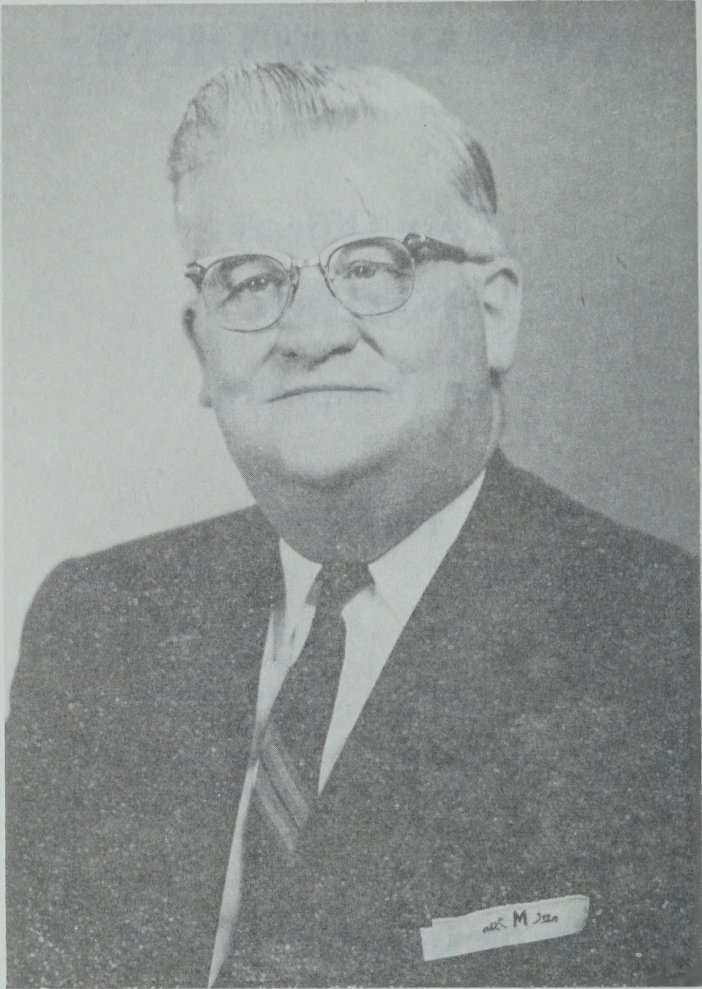
Congressman Chester E. Merrow