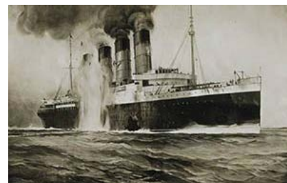
Torpedoed Lusitania