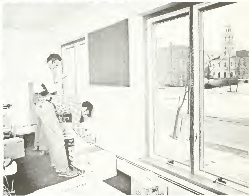
EXETER'S NEW PUBLIC SAFETY COMPLEX