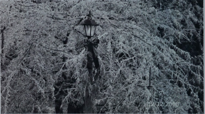
December 2008 Ice Storm