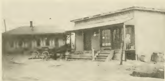
Madbury Depot near General Store and Post Office circa Turn of the Century.