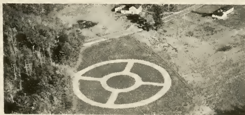
Madbury Town Cemetery Town Hall Road. Photo by Mike Childs, Pilot Joseph Moriarty.