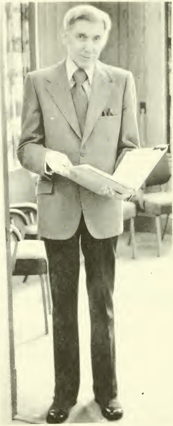
MAYOR JOHN SHAW