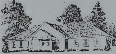
New Durham Library Resource Center New Durham, New Hampshire

We have expanded our hours to better serve working people. The new hours are: