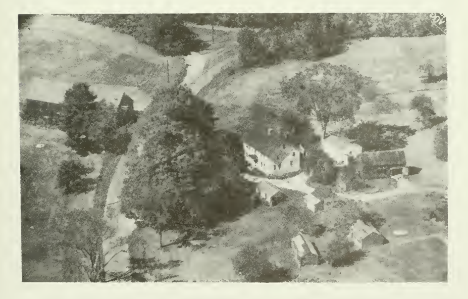
Town Hall Road Circa 1950. Tibbetts Homestead on right Town Memorial Park to be located in field at upper left. (Madbury Historical Society collection)