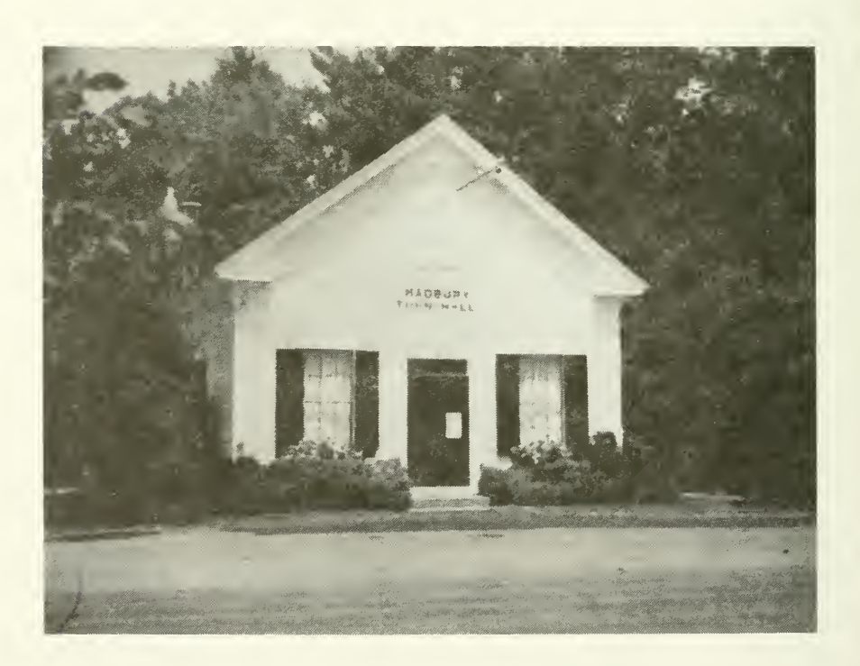
Town Hall circa 1960