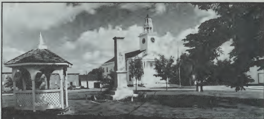
Typical New England scene—the common in Troy, N.H.