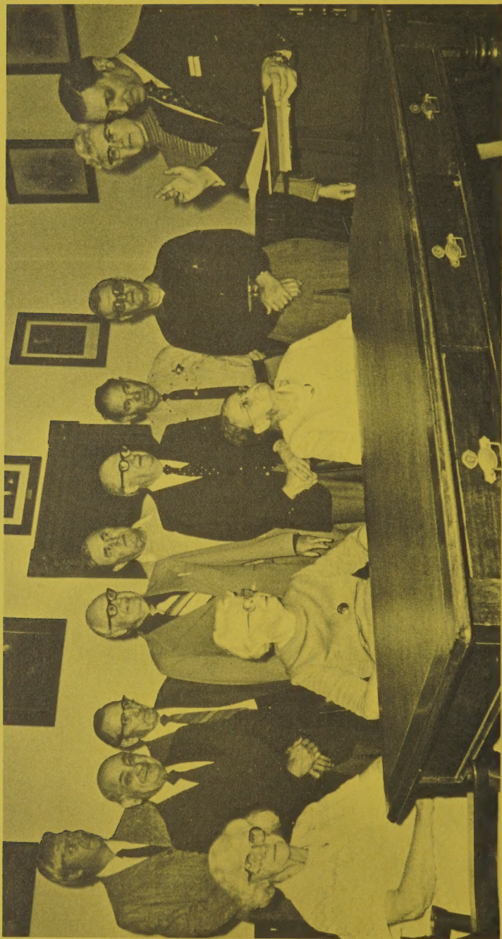
Sullivan County Officials