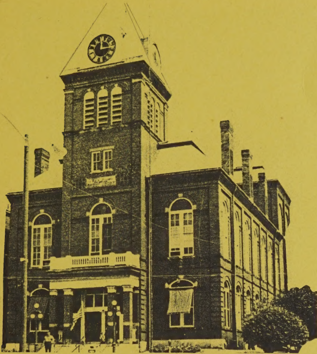
Sullivan County Court House Newport, N.H.