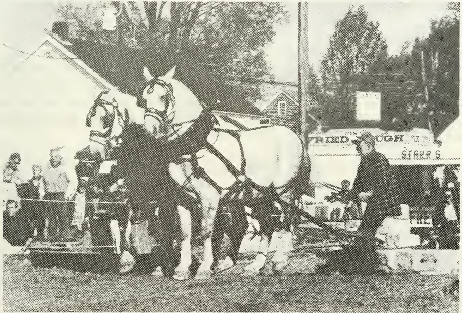
Sandwich Fair 1996