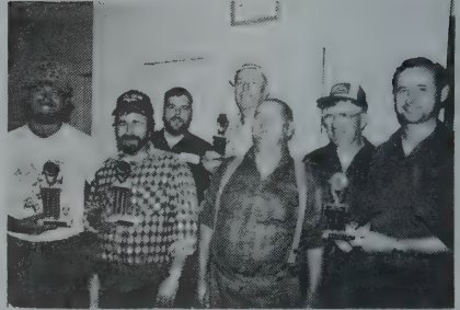
Highway Crew with Trophies Plow Rally — Sept. 1990