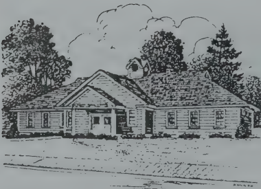
New Durham Library Resource Center New Durham, New Hampshire

By now the Library Resource Center has become a familiar part of the architectural landscape of the town of New Durham. Its location near the town hall, general store, and elementary school makes it easily accessible to town residents. Perhaps this, as well as the increase in population, accounts for the fact that library circulation has more than doubled since its opening in 1987.