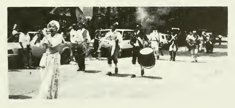
Newmarket Militia - Madbury Day 1991.