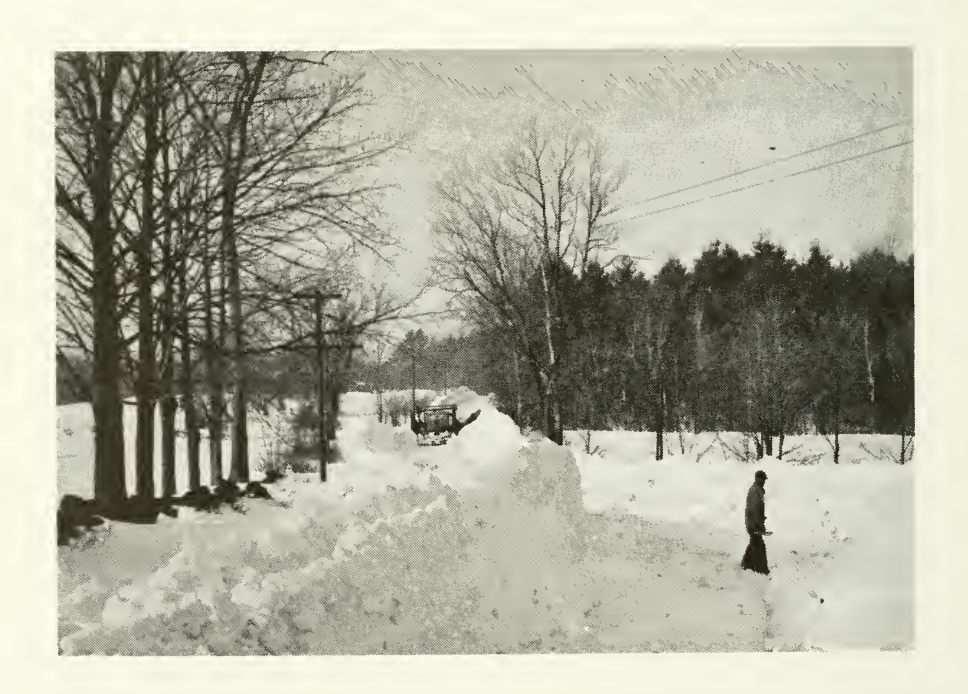
Clearing Pendexter Road Winter 1944-45