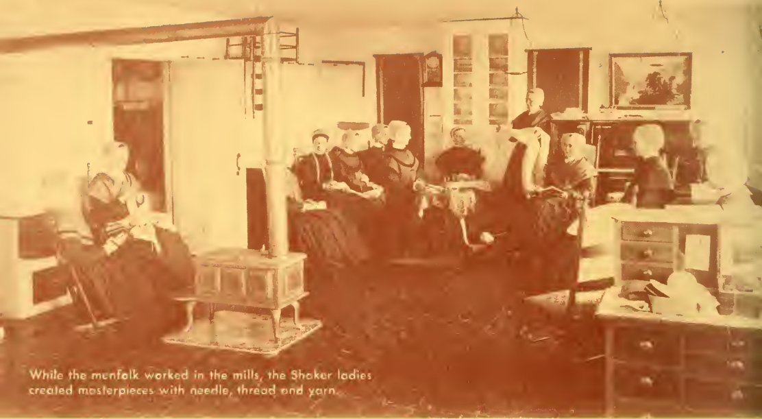
While the menfolk worked in the mills, the Shaker ladies created masterpieces with needle, thread and yarn.