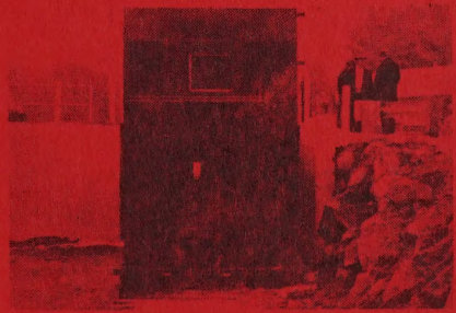
"NEW" TRANSFER STATION at the NEW DURHAM SOLID WASTE FACILITY