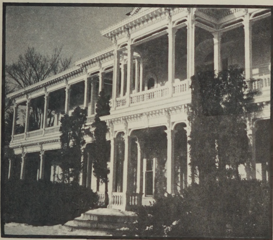
Charles E. Tilton Hall