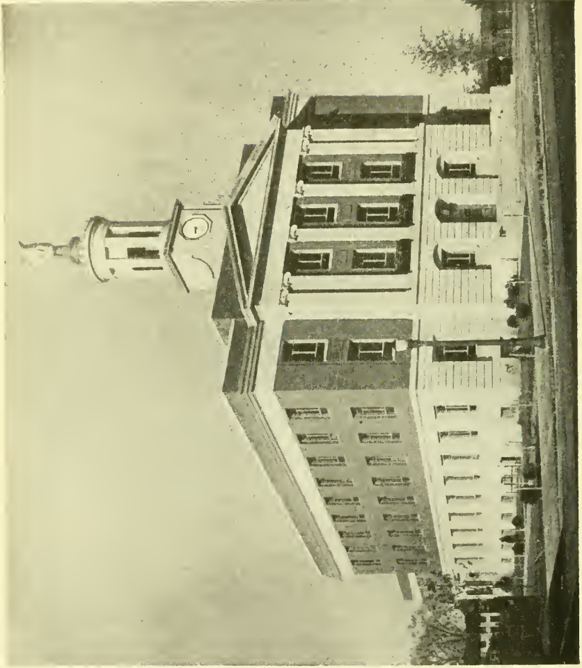
NASHUA CITY HALL