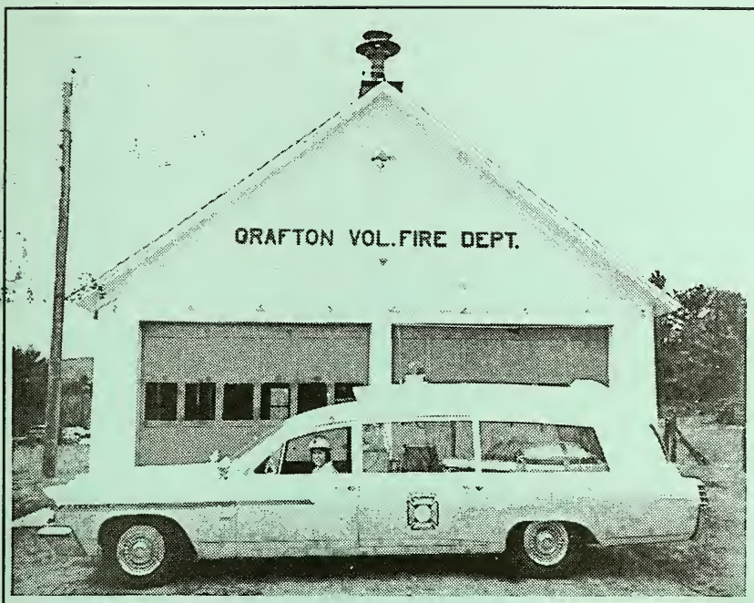
Grafton Volunteer Ambulance 1975 - 1995