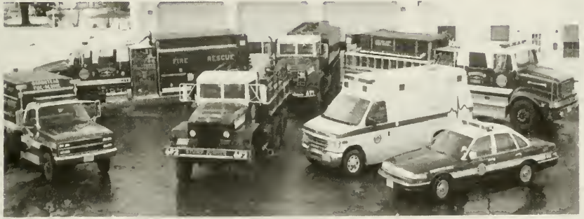
"Marriage" of Center Barnstead, Barnstead Parade Fire Departments, and Barnstead Rescue